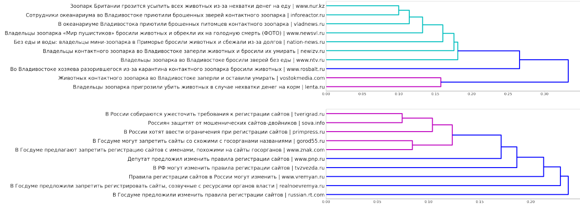
Figure 2: Dendrograms for two clusters based on USE embeddings, cosine similarity, and average linking. These clusters contain several errors.